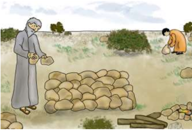
Abraham built the altar for the offering.