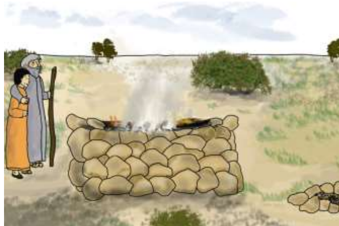
The ram was offered to Yahweh instead of his son, Isaac.