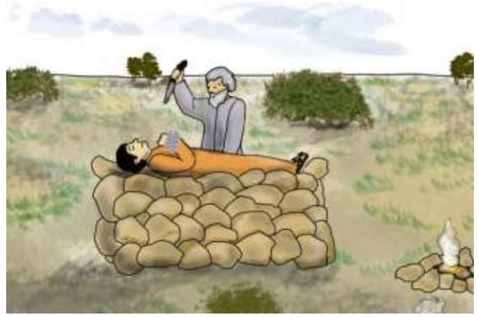
He laid Isaac on the altar and stretched out his hand to slay his son.